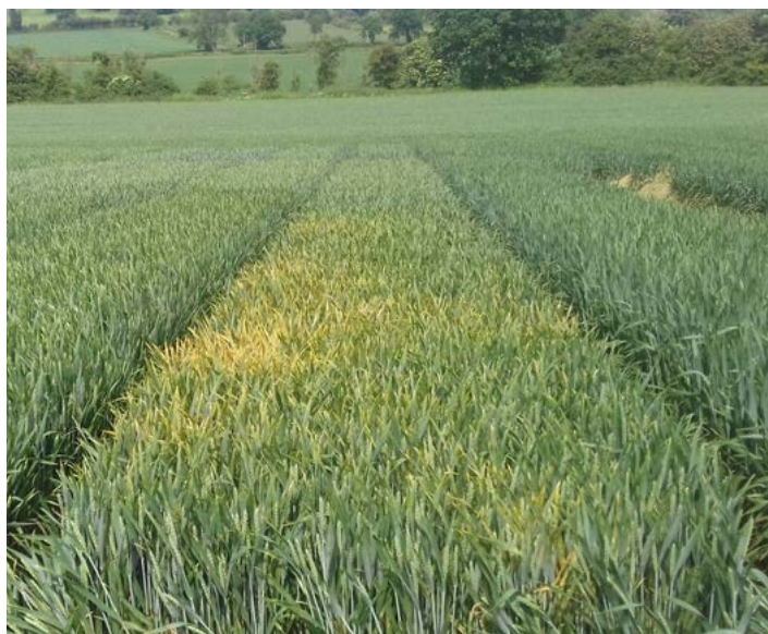
Figure 3. Yellow rust symptoms in wheat at a fungicide performance trial site

ahdb.org.uk/knowledge-library/fungicide-performance