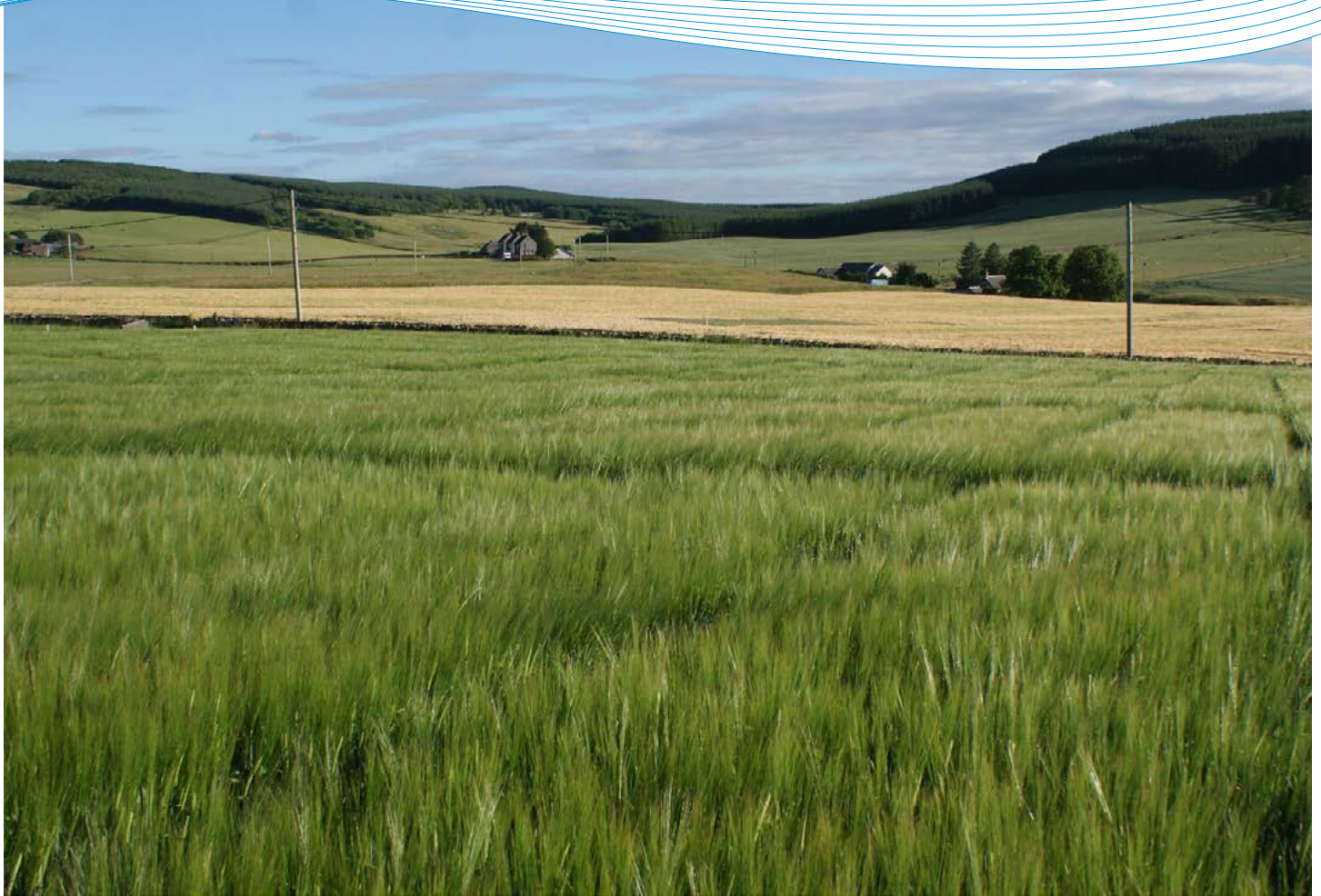
Figure 1. Fungicide performance barley trial plots at Lanark, Scotland (2018)